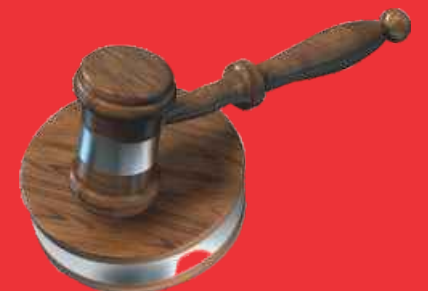
BLC Class Room

The placement officer assists the process of career exploration and decision-making, helping them identify employment opportunities and field placements appropriate to their background, training, goals and interests.