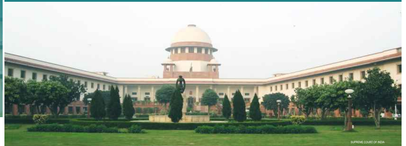
SUPREME COURT OF INDIA