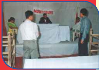
Moot Court in BLC campus