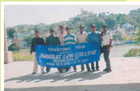
An Educational Tour to Mount Abu

Admission in LL.B. second year and third year is must within 15 days of declaration of result.